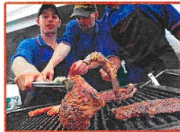
Taste of the Dells