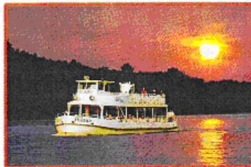
Party Barge Cruise

Leaving at 8:30 p.m. from Chula Vista Boat Docks. Combine great music, great drinks, and the beauty of the Wisconsin River with unlimited drinks including beer, wine, rail liquor and soda for two full hours!