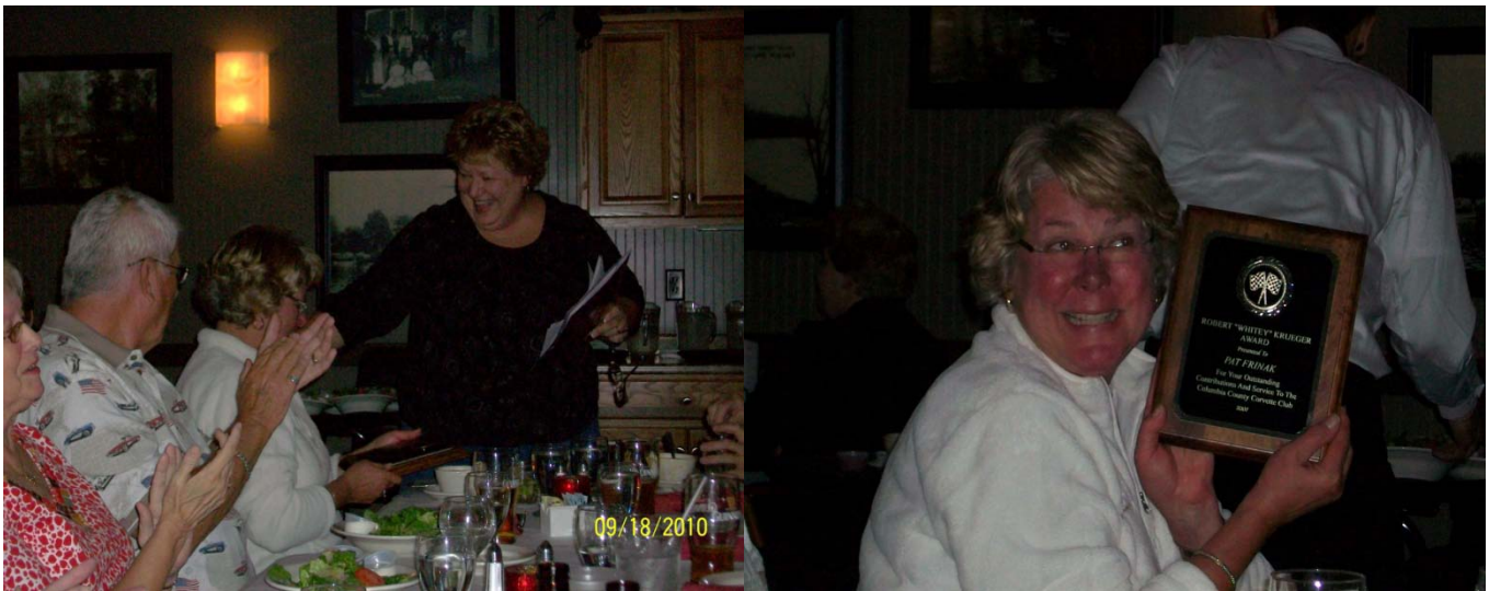
I think she was in shock